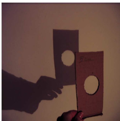
Figure 3: The shadow of a hole on the wall

The girl started her observations by putting pieces of pasteboard with holes of 20 cm, 15 cm and 10 cm diameter in front of a white light lamp (Fig. 3). She observed the shadows on a white wall by moving the holes between the lamp and the wall. Very soon she was disappointed by the results because she observed nothing interesting. After a meeting with the teacher she decided to consult some physics books and she "discovered" light diffraction. During her presentation in the classroom she prepared a good Power Point presentation, and she insisted also in showing in the classroom the diffraction of a red laser light by a small hole made by a pin.