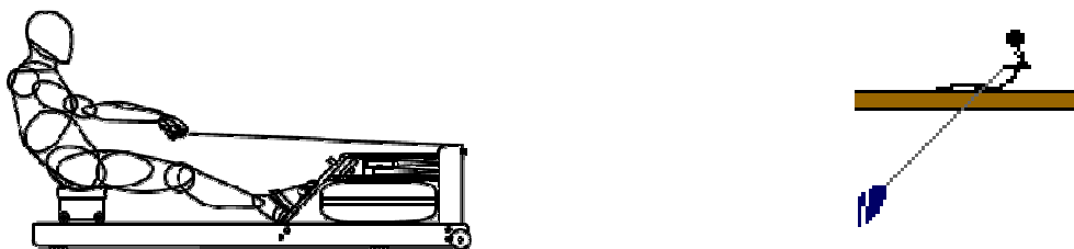
Figure 1: The movement and the animation of the canoeist in rowing

A large part of the students completed their presentations in the classroom by showing the experiment they had created at home using all kind of things, like kitchen or other tools or toys.